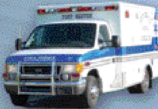
Horton Ford E-350 138" Dual Rear Wheel Chassis Type III - Model # 453