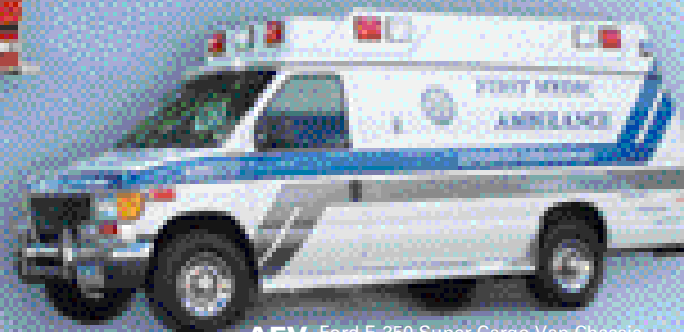
AEV Ford E-350 Super Cargo Van Chassis Type II Van - Model 2K High Trim