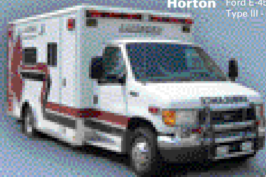
Horton Ford E-450 158" Dual Rear Wheel Chassis Type III - Model # 553