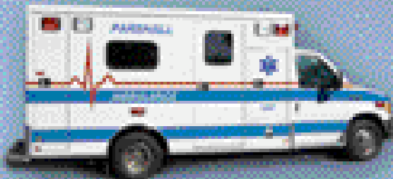
AEV Ford E-450 158" Dual Rear Wheel Chassis Type III - Model 164" Fliteline Z5

Members of North Central EMS Coop will receive a 6% discount off suggested retail price. Call or email for pricing information.