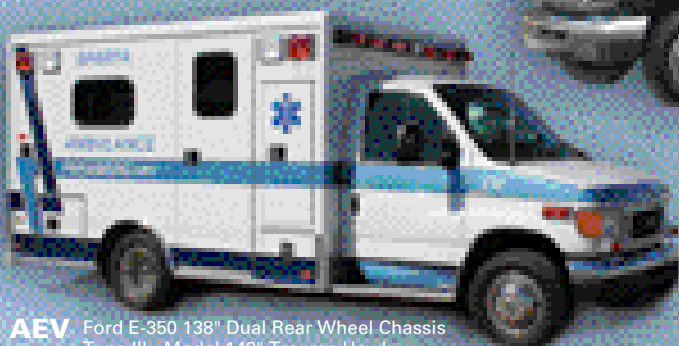
AEV Ford E-350 138" Dual Rear Wheel Chassis Type III - DR-90 Trauma Hawk